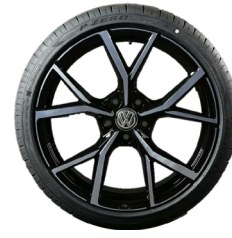
01 19" Estoril black, diamond-turned alloy wheels 8J x 19