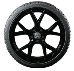
02 19" Estoril black alloy wheels 8J x 19*

*only available on the Golf R 20th Anniversary Edition